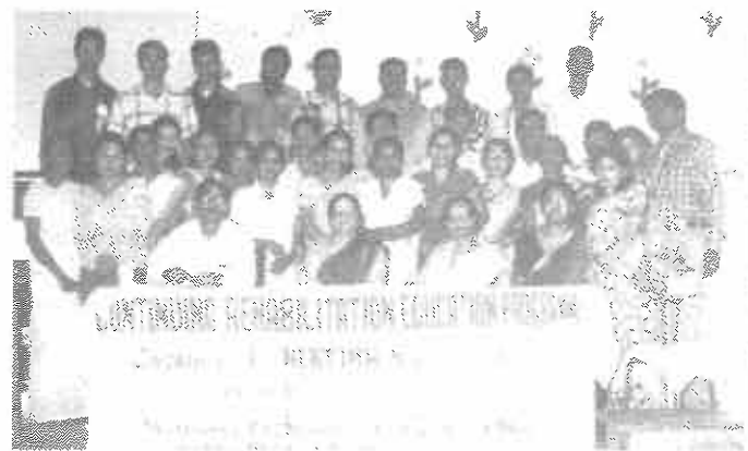
Participants of a CRE programme