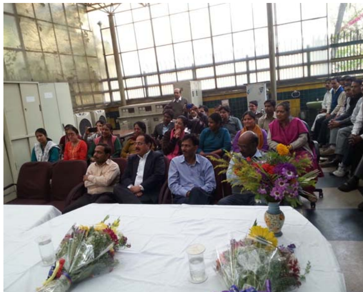
Staff Members of the Council during the welcome and farewell function of Member Secretary.